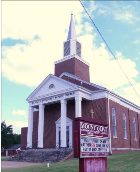
Mount Olive Missionary Baptist Church, Vision for the Kingdom of God. Matthew 28: 19-20